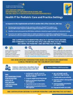
Health IT for Pediatric Care and Practice Settings [PDF - 477 KB]