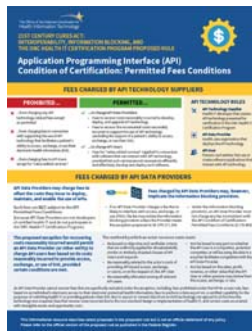
Application Programming Interface (API) Permitted Fees [PDF - 405 KB]