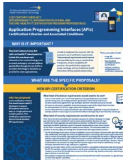
API Certification Criterion and Associated Condition of Certification [PDF - 1.1 MB]