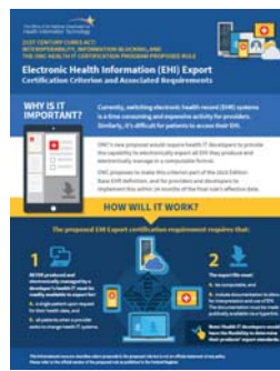
Electronic Health Information Export for Patient and Provider Access [PDF - 1.6 MB]