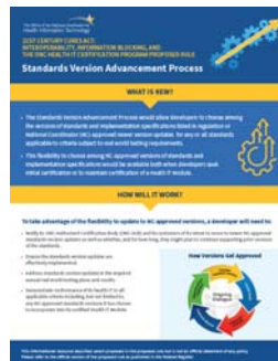
Standards Version Advancement Process [PDF - 442 KB]