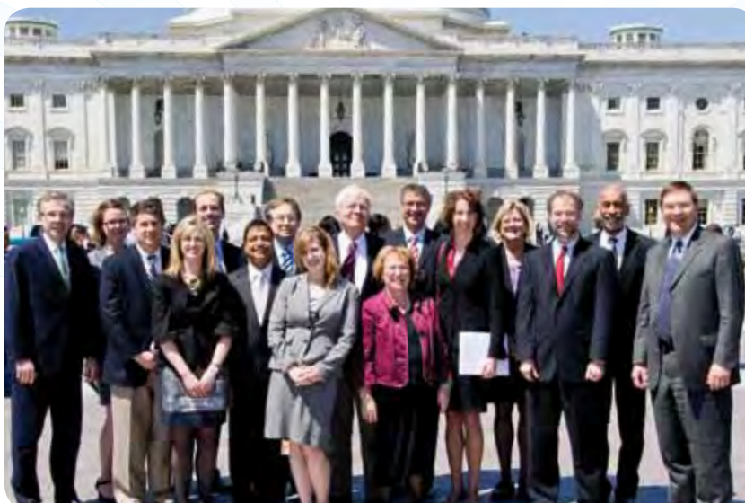
Some ASN Hill Day participants congregate in front of the U.S. Capitol at midday.