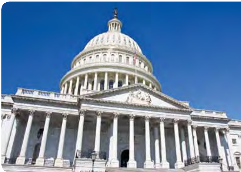
U.S. Capitol Building.

ASN members discussed the society's public policy priorities: support for robust, sustained funding for medical research, lifetime immunosuppressive drug coverage for transplant recipients, and access to high-quality care for kidney patients in new care delivery models. ASN members also discussed the top priorities of erasing health disparities in